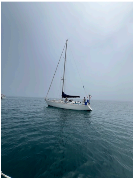
Argo heading back to Ventura Harbor