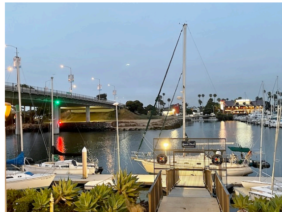
Argo & Ecco Bella at dock at PCYC