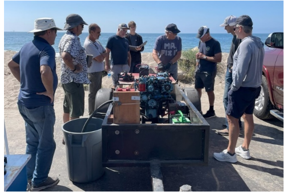
Illustrating how a starter motor works