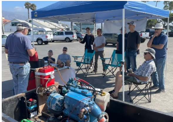
Outdoor classroom students

Next was a two-part Diesel Engine Maintenance seminar consisting of an introduction to diesel engine maintenance on Tuesday night the 20 th of August, followed by a hands-on demonstration on the following Saturday morning. We had eight attendees and the hands-on demo was extremely well received.