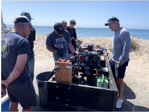
Demonstrating how to bleed air after fuel filter change