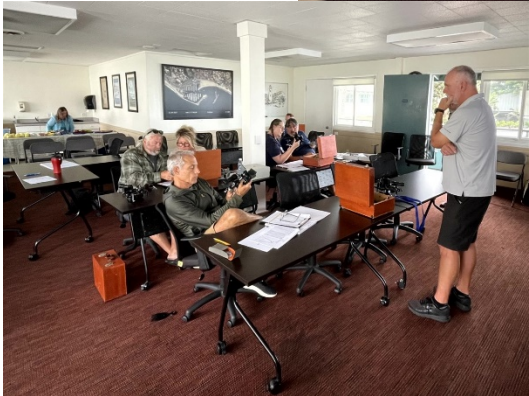
Getting ready to have a little lunch before heading out to the breakwater