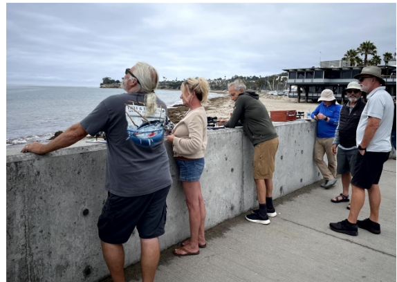
Where'd it go?